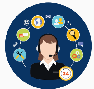
24x7 Network Operations Center