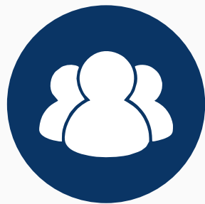
Monitoring Desk Team