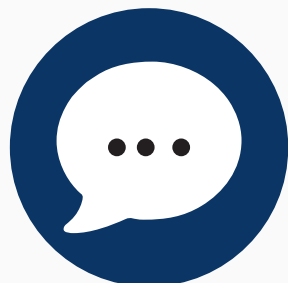
Social media chat escalation