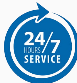
Social media chat escalation