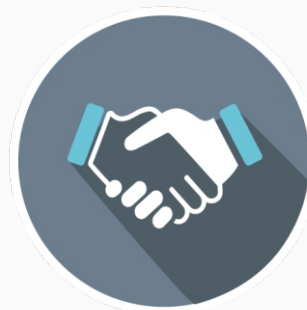
300 + satisfied clients