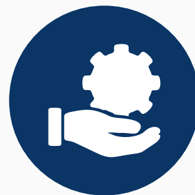
Advanced Customization Services