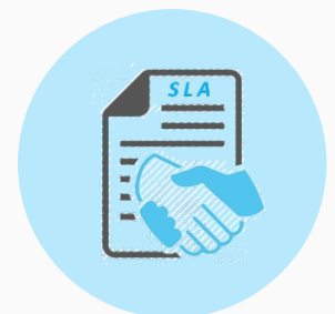
SLA > 95%